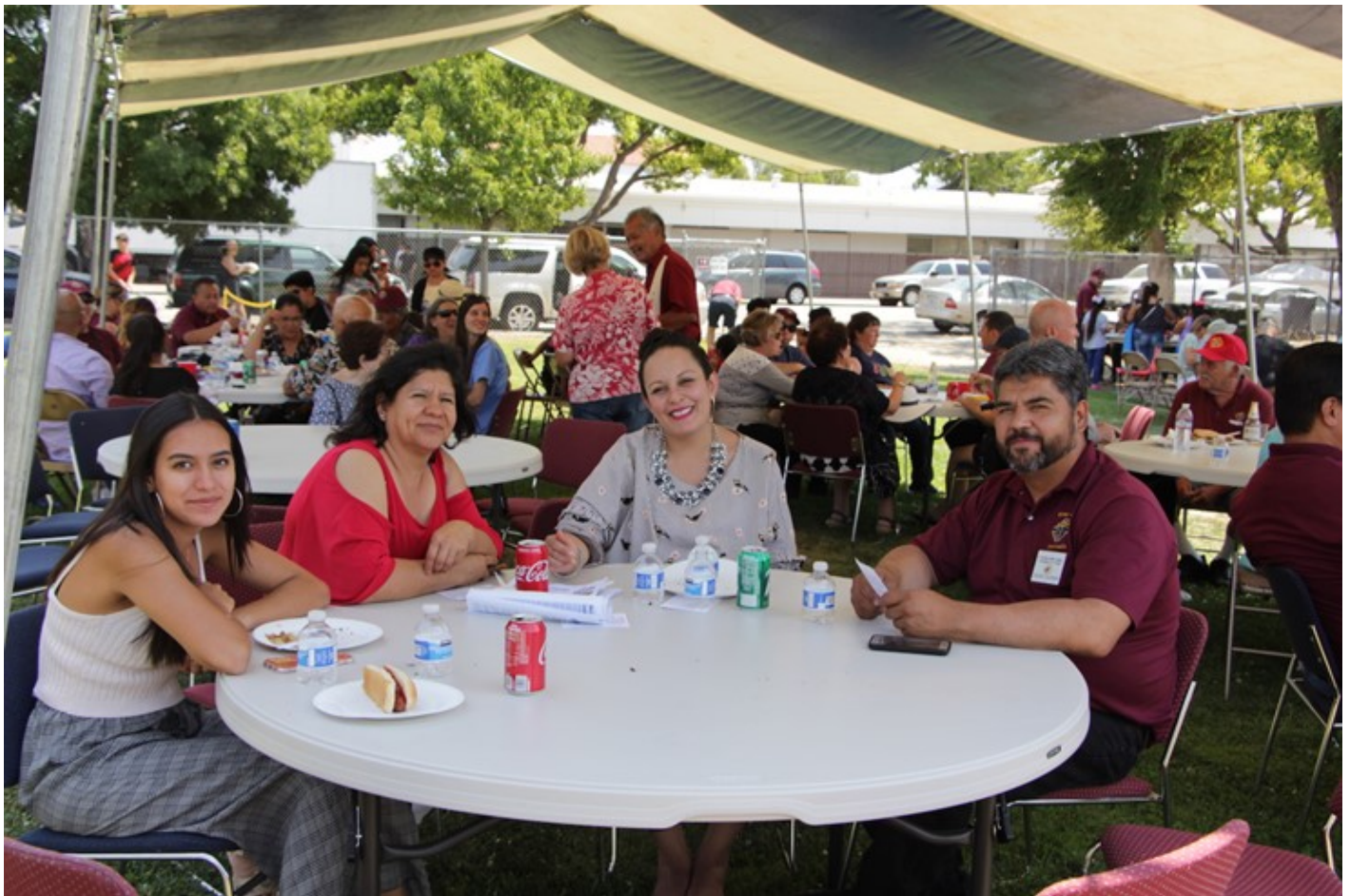
Knights' families enjoying a weekend of fun and reflection

Capping off the Knights of Columbus Family Week, the Livermore Knights of Columbus sponsored a weekend of activities to strengthen families and the Livermore community. The Father Patrick Power Council #4588 coordinated a Hispanic Family Retreat with themes designed to strengthen families, a Family Mass with a special consecration to the Holy Family, a rosary for Knights in need, an old-time family picnic with food, music and games and the 2018 K of C Soccer Challenge. With over 100 attendees on both days, the event brought the council together for two days of reflection, fun and community-building.